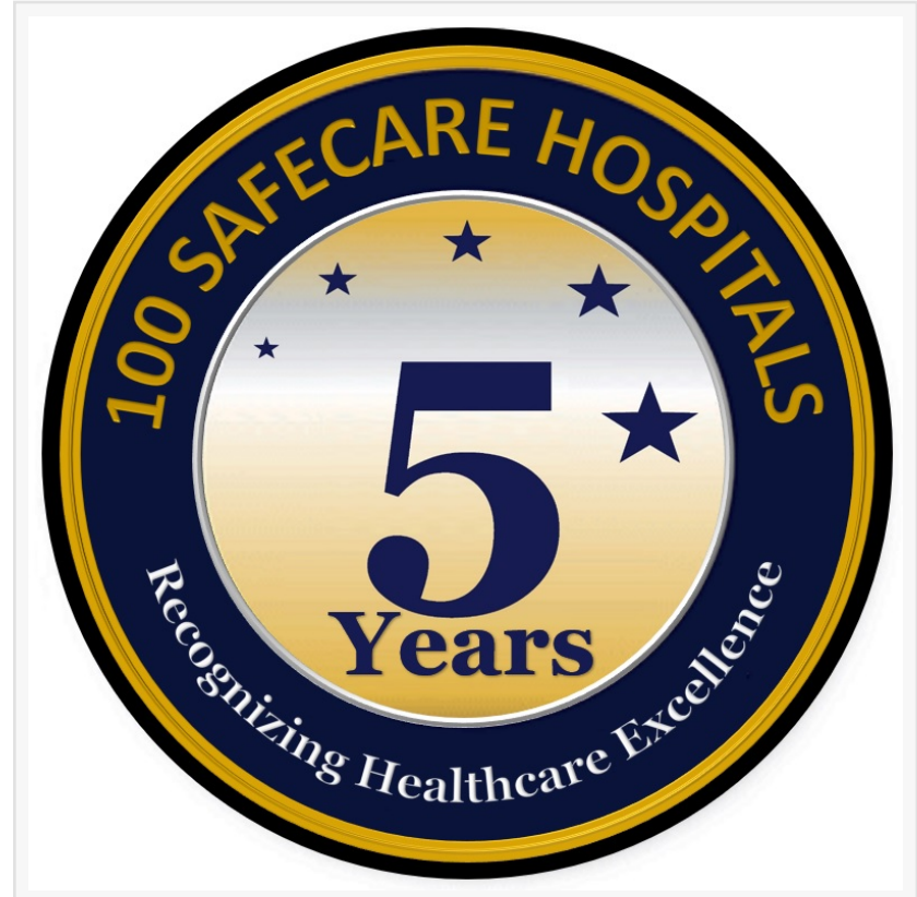
100 SafeCare Hospitals 5th Anniversary

About The SafeCare Group The SafeCare Group was founded in 2010 and is a privately held company with the motto Softwaring Healthcare Excellence®. The SafeCare Group software solutions enable hospitals to take advantage of disruptive healthcare technologies that optimize hospital reimbursement and accreditation. Since 2012, SafeCare Analytics® have been helping hospitals excel with physician privileging software for Joint Commission OPPE, and hospital software for better readmissions, cost, complications and infections. Since 2013, 100 SafeCare Hospitals® listings have been Recognizing Healthcare Excellence® of 100 US hospitals that excelled with low infections, readmissions, and complications. Since 2015, SafeCare® magazine has been delivering