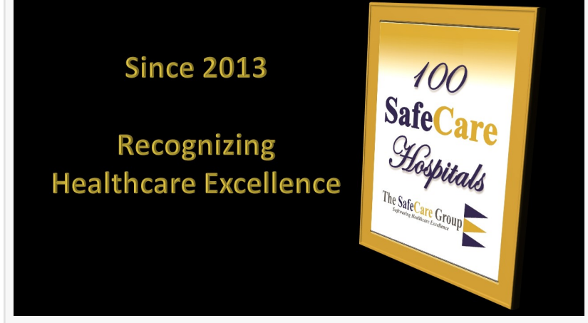
100 SafeCare Hospitals - Since 2013

information on the people, ideas and novel technologies affecting access, cost, and quality of healthcare across the globe. For more information about The SafeCare Group, visit <a href="https://www.safecaregroup.com">www.safecaregroup.com</a>.